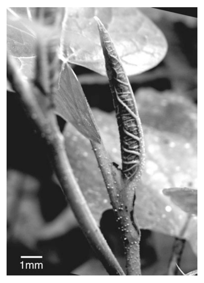
Figure 1. Young leaf and apical growth emerging from sheathing petiole of Piper imperiale . The membranous margins of the petiole remain green until the next leaf emerges, or longer, and arboricolous ants may use the resulting chamber as a nesting site. Elevated spots on stems and petioles are tubercles.

In the majority of the remaining species, the margins of the sheathing petioles partially senesce, to a greater or lesser degree, soon after emergence (Fig. 2A–C; Table 2). Once the apical growth has emerged, the persistent portions of the margins stay in an open position in some species, resulting in an open 'U'-shaped cavity (Fig. 2A, B), but, in others, the margins return to their positions prior to emergence of the apical growth and form a more or less closed, hol-