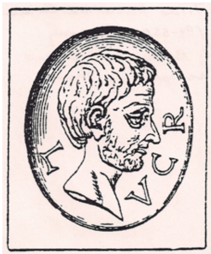
Figure 3. A 19th-century drawing of a Roman finger ring thought to depict the Roman poet and Epicurean, Titus Lucretius Carus (c. 99-55 BC). This is the only known contemporary image of the poet.

study by Cyril Bailey (2). Even in the case of Epicurus, much of what we know about his version of the atomic theory comes, not so much from his own surviving writings, but from the epic poem, On the Nature of Things , composed by his Roman disciple, Titus Lucretius Carus (figure 3), sometime around 60 BC. As a result, many popular accounts of early atomism mention Lucretius while totally ignoring Epicurus (3), even though Lucretius intended his poem to be a faithful rendition of the ideas of Epicurus rather than an exposition of his own personal philosophical ideas (4).