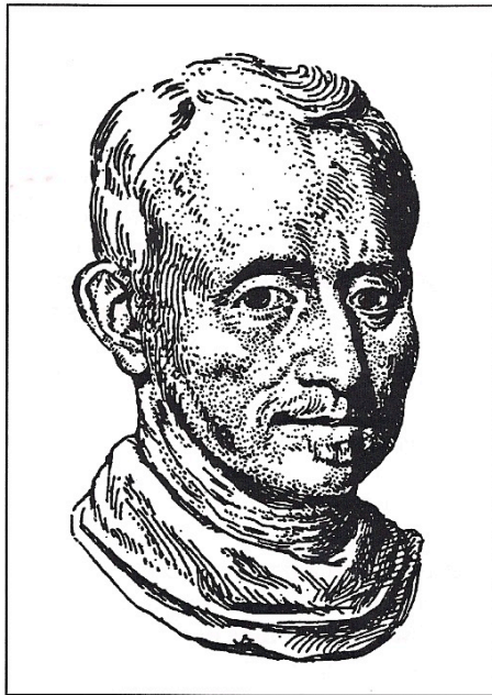
Fig. 3. Excerpted and reversed image of Van Helmont's head from figure 2.