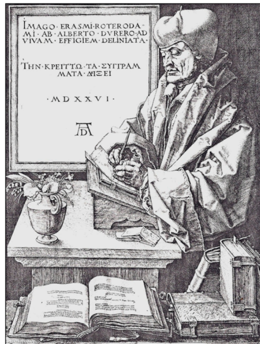
Figure 2. Desiderius Erasmus of Rotterdam (c. 1467-1536). An engraving by Albrecht Dürer showing Erasmus in the year 1526, shortly after he composed his dialogue on alchemy.

As already noted, the dialogue entitled "The Alchemist" was first added by Erasmus to the Colloquies in 1524. It tells the story of the duping of a wealthy