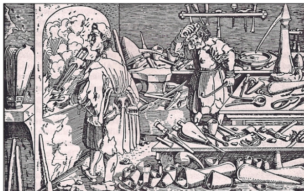
Figure 3. The alchemist and his assistant, a woodcut by Hans Weiditz first published in 1532 but thought to have been done about 1520, thus making it almost exactly contemporaneous with Erasmus’ dialogue on alchemy.

Philecous : That is one way, however, of changing the species of things.