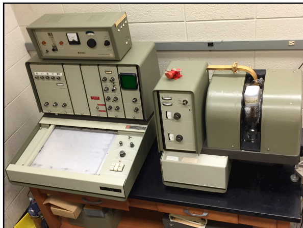
Figure 4. The Varian E-4 EPR instrument as it appeared while still in use in Dr. Bobst's laboratory.

Survey of 600 Years of Chemical History for Students of Chemistry , Oesper Collections: Cincinnati, OH, 2003, pp. 237-238. Available on line.