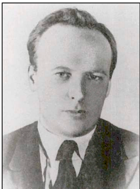
Figure 1. Yevgeny Zavoisky (1907-1976)