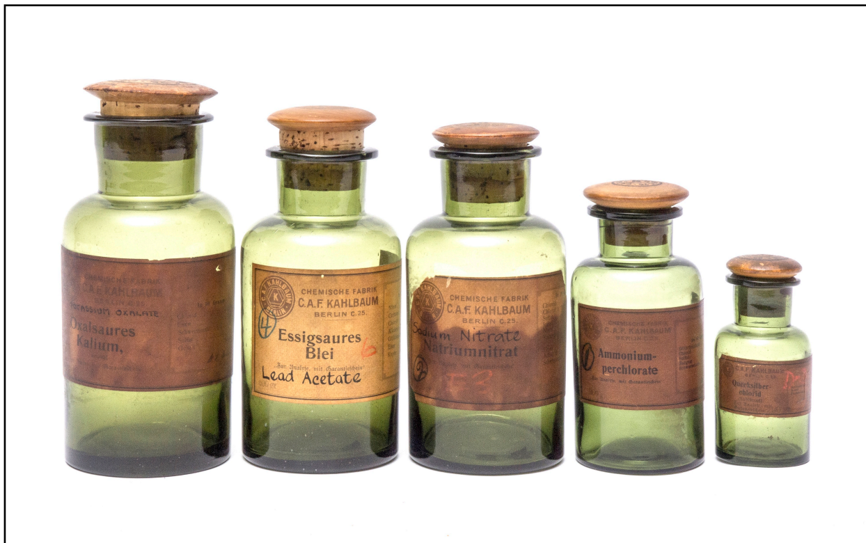
Figure 3 (Above). An array of circa 1910 bottles that originally contained chemicals produced by the C. A. F. Kahlbaum Chemische Fabrik of Berlin Germany.

of various chemicals used in pharmacy and medicine. A particularly striking example from our collections is the bottle shown in figure 4 which contains tablets of mercury dichloride, commonly known as “corrosive sublimate.” Now occasionally used externally as an antiseptic and disinfectant, in the 19th century this extremely toxic compound was most often administered internally to treat syphilis, though, according to Remington, it was also taken for chronic rheumatism (1).