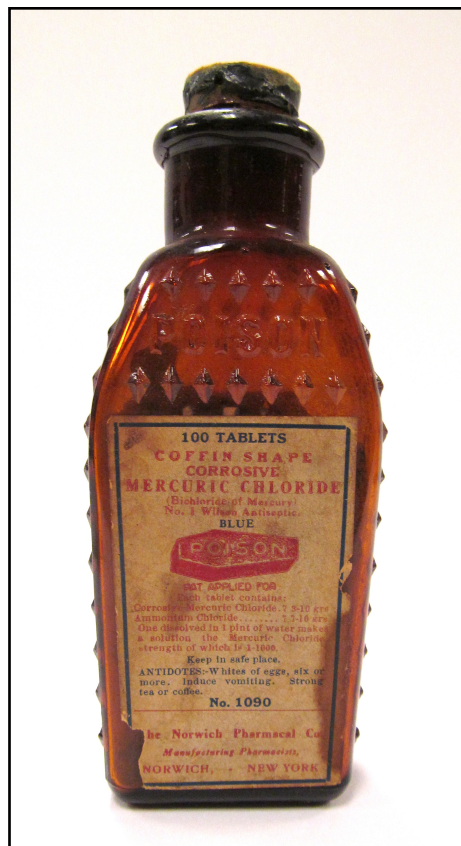
Figure 4. A circa 1890 coffin-shaped bottle of poisonous mercury dichloride tablets.