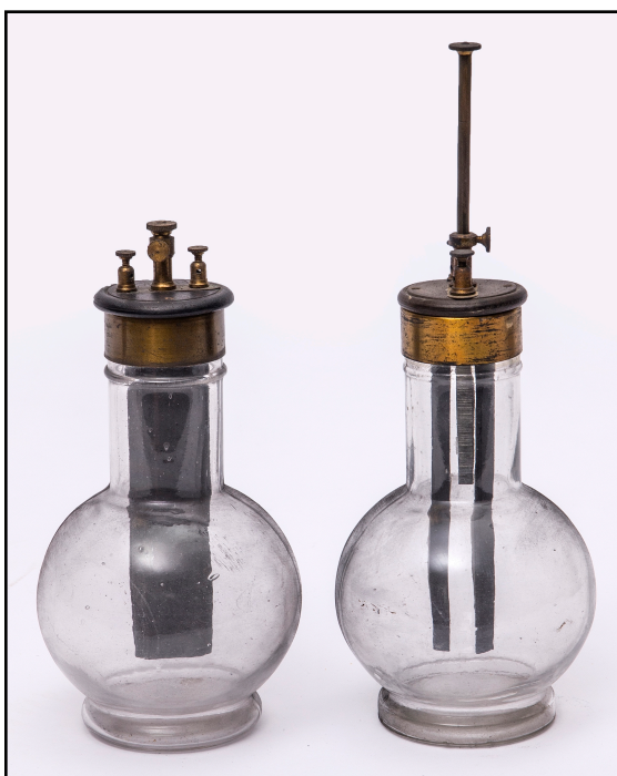
Figure 4. Examples of surviving half-liter Grenet cells (Jensen-Thomas Apparatus Collection). The cell on the right has its Zn anode raised.

plates and mounted in a special round-bottom flask. They were sold in sizes ranging from a fourth liter up to two liters (9). The anode was connected by means of