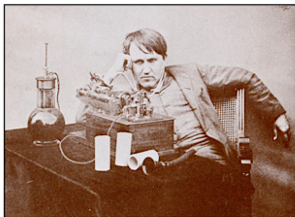
Figure 5. A famous photo of Thomas Edison posing in 1888 with his improved phonograph. Note the two-liter Grenet cell on the far left. Also note that its anode is in the raised position, thus indicating that it is not in operation.

Despite its large cell potential, the dichromate cell had the disadvantage that it gradually consumed its electrolyte as part of the net cell reaction and thus exhibited a progressively decreasing potential with continual use. It was most practical in situations requiring a short burst of high voltage, such as in detonating mines and other military applications, where detonation was achieved by rapidly plunging the Zn anode into the dichromate electrolyte. In addition, secondary reactions led to accumulation of dihydrogen bubbles on the cathode surface and to a subsequent drop in cell efficiency – a phenomenon known as polarization.