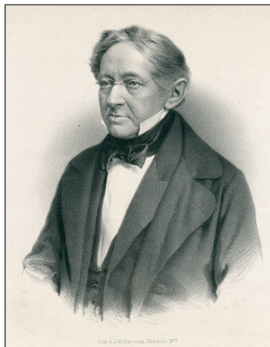
Figure 1. Johann Christian Poggendorff (1796-1877).

in which Zn(0) is oxidized to Zn(II) at the anode, Cr(VI) is reduced to Cr(III) at the cathode, and the resulting net cell potential is roughly 2 V.