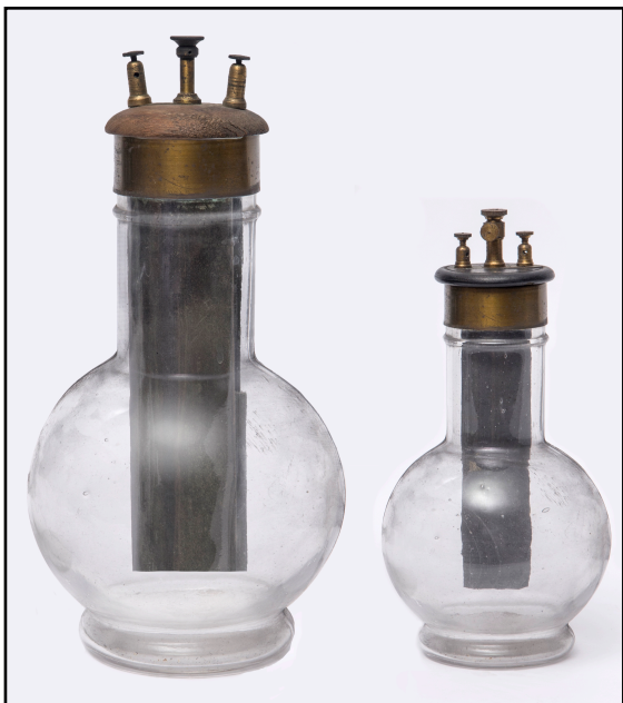
Figure 3. A large two-liter Grenet cell and a smaller half-liter cell (Jensen-Thomas Apparatus Collection).

plates and mounted in a special round-bottom flask. They were sold in sizes ranging from a fourth liter up to two liters (9). The anode was connected by means of