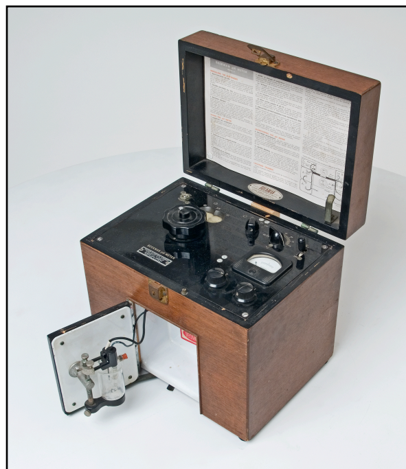
Figure 4. A circa 1945 Beckman pH meter (Oesper Collections, University of Cincinnati).

The pH concept was initially of most interest to biochemists, who used a variety of abbreviations, such as pH , pH + , Ph , etc. before finally settling on our current choice of pH . By the late 1930s and early 1940s the concept had also begun to make its way into the