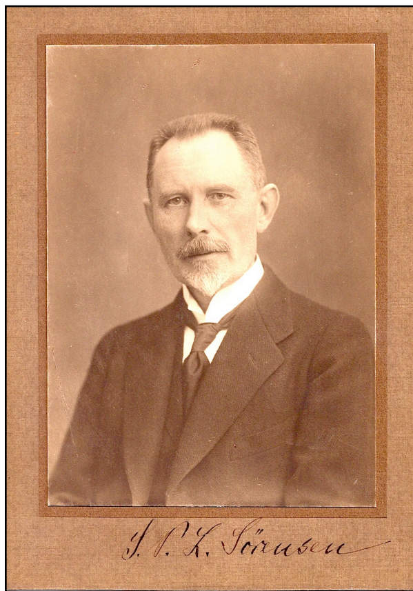
Figure 1. An autographed card photograph of Sørensen in middle age.

The answers to both of these questions are partly historical and partly scientific in nature and involve the work of the Danish biochemist, Søren Peter Lauritz Sørensen (1868-1939) (figures 1 and 4), who first pro-