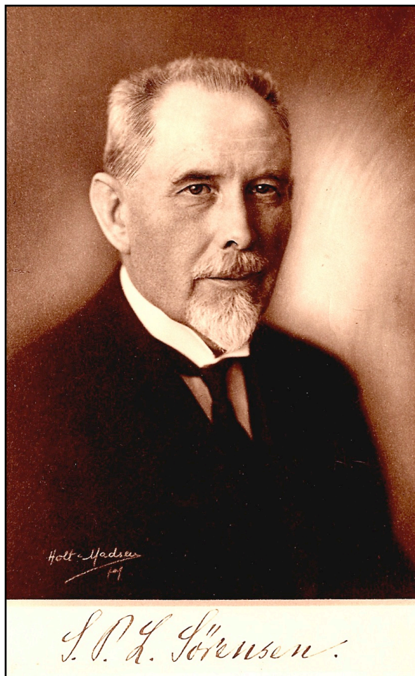
Figure 4. An etching of Sørensen in later life (Oesper Collections, University of Cincinnati).

Finally, we might ask why Sørensen chose the letter p to symbolize the exponent of his H^+ concentration? Unfortunately, he does not directly tell us, which has led some to speculate that the choice was arbitrary. Others, however, noting that in several places he refers to pH as the puissance (French) or potenz (German) of the hydrogen ion exponent, have suggested that it is an explicit abbreviation for these two words, which, luckily, translate into English as yet another word p-word - power . In other words, just as we talk of 5^2 as being 5 raised to the second power, or 6^3 as six raised to the third power, so in the expression 10^{-p} for the H^+ concentration, p represented the puissance , potenz or power of the exponent.