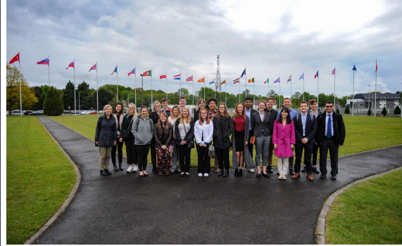
Supreme Headquarters Allied Powers Europe