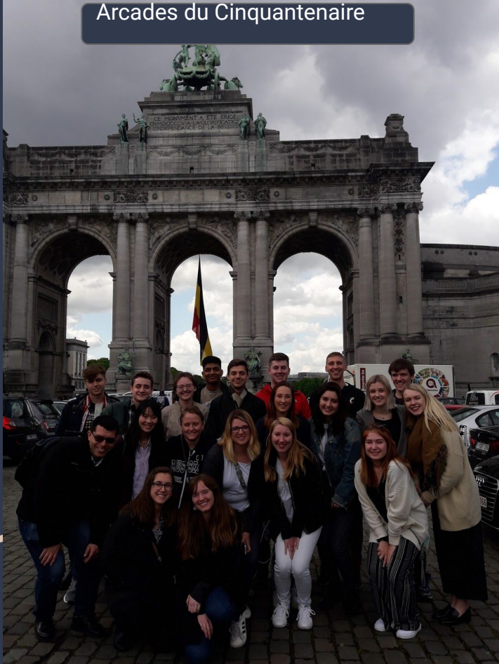
Arcades du Cinquantenaire

On Sunday Afternoon, we took a bus tour of Brussels and were able to see the landscape of the city as well as its largest monuments and attractions!