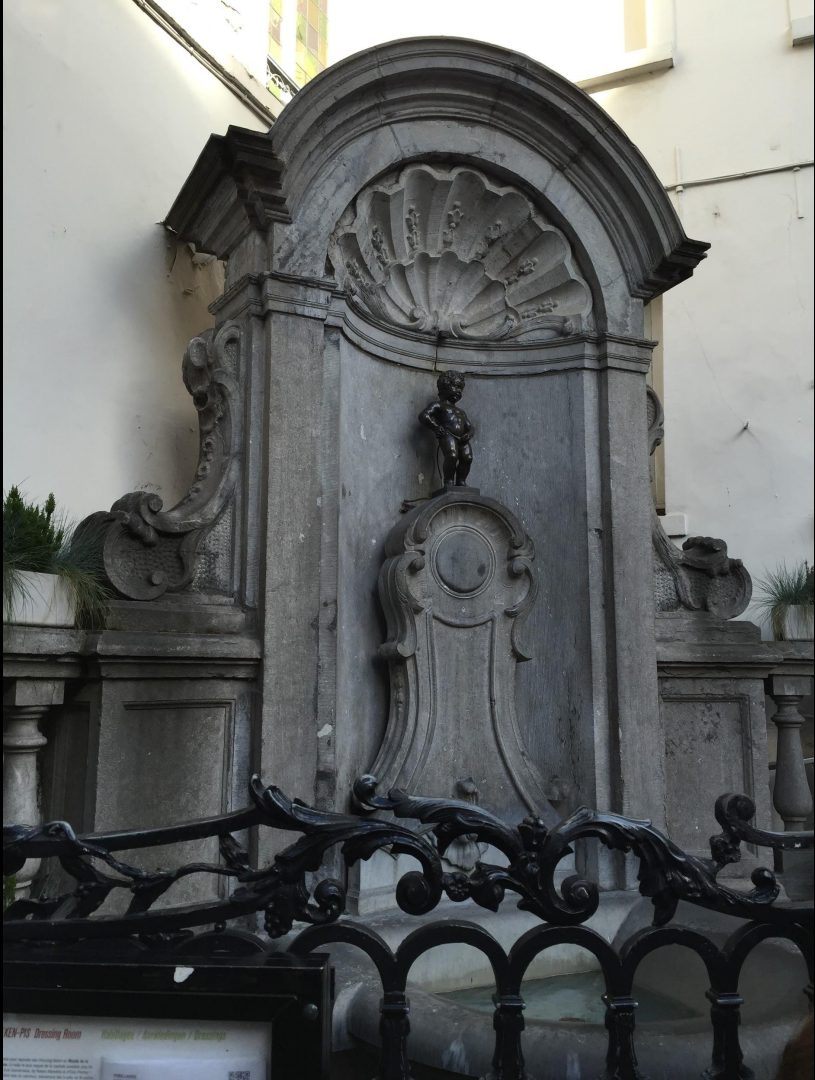
MANNEKEN-PIS Dressing Room - Wikipedia / Architectural / Brussels

This is the Manneken Pis. We were able to take a detour to see the most famous statue in Brussels. Beautiful right?