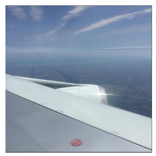
View of Lake Michigan as we approach Chicago