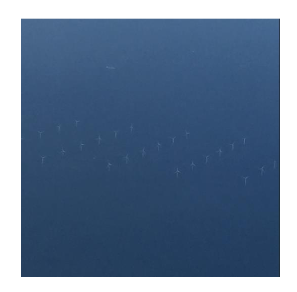
Wind Farm in North Sea